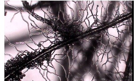
Untreated (Filter Fibres)